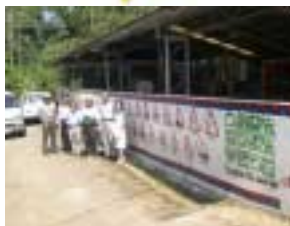
Traffic signs painted on the walls

The travelling seminar started from Taipei to Alishan on 27 th October, we have visited different villages in the mountain area of Alishan, we have observed a great involvement of the local population in Alishan area for Safety promotion within their community.