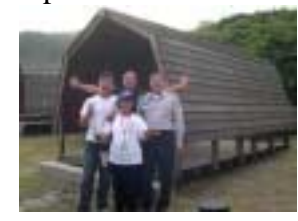
Safe Community group in Fongbin