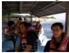
dissemination on water safety