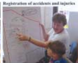
On a whiteboard we do markplaces where accidents and injuries have happened. We want to have a safety and exciting school and playground