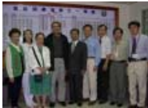
visiting the Dungshr Farmer's bank and hospital

On 29 th October the delegates visited the Dungshr community in the middle of Taiwan and observed different type of safety promotion activities in the Dungshr Community, mainly related to the agriculture, home, school and road Safety.