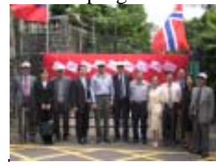
In Grand Green Land, demo. of violence and crime prevention activities

These four communities (Dungshr, Neihu, Alishan and Fongbin) in Taiwan has developed an interesting models for safety promotion activities in different levels in their community, they are aiming for designation of these communities as a WHO Safe Community within 2005.