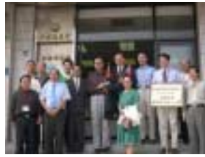
Dungshr Farmer's activity center: Dungshr Safe Community Briefing