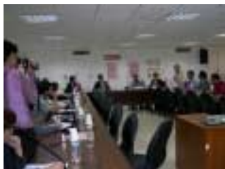
Neihu district office – Briefing of Neihu community

We have visited different sites to experience different levels and types of safety promotion work related to Violence/crime prevention, safety for elderly, construction Safety, warehouse safety and Traffic Safety. The fire safety museum in Neihu is playing a great role in educating the children and adults on fire prevention and teaching them the basis of CPR programs.