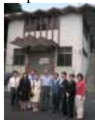
This house will be build up as model of Safety house