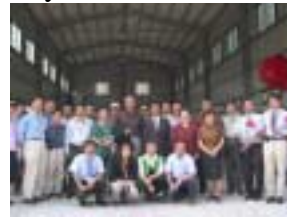
visiting the Farm Safety model in Dungshr