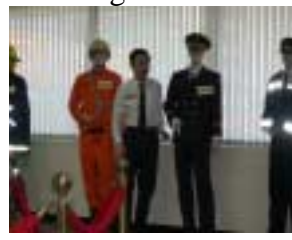
Fire Safety Museum