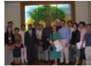
Elderly Care Center - Elderly Safety