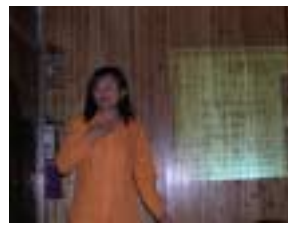
Project leader presenting the combination of health and Safety promotion