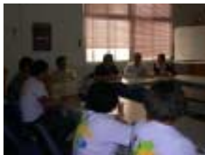
A briefing of Fengbin community

The Fongbin as a tourist area has a remarkable number of injuries related to tourists, those whom interested in water activities, rafting and watching whales- and dolphins.