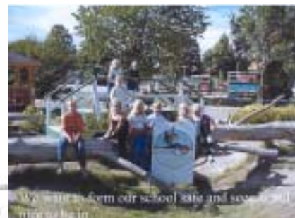
We want to feel our school safe and secure We want to be in

Källby Gård serves as the first example to schools worldwide of the comprehensive approach to safety ISS designation epitomizes. ISS designation does not mean a school has eliminated all injury and violence. Rather designation means that a school approaches safety promotion as an integrated system, an “ecosystem” of sorts, that relies upon ongoing local data collection, analysis, and evaluation as the school implements science-based programs and practices to effect systematic change. Specific issues, activities, and programs are determined, designed, and carried out by students, staff, and members of the surrounding community in response to their particular context.