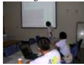
Voluntary workers, presenting their safety promotion activities