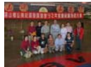
The travelling seminar participants and Safe Community group.