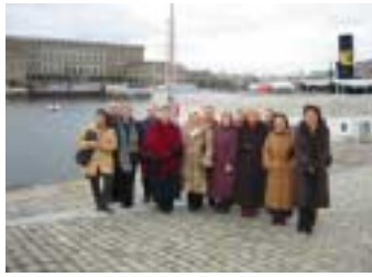
Workshop participants with Stockholm Royal Castle in the background