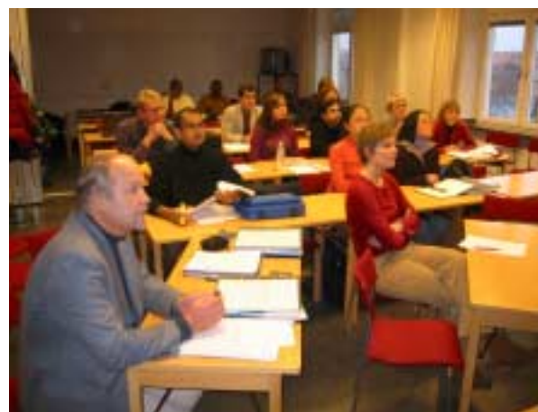
Lecture at Karolinska Institutet