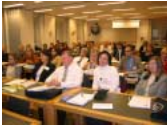
Workshop together with MPH Course at Karolinska Institutet