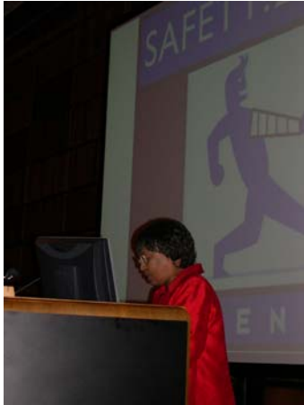
Dr. Manto Tshabalala-Msimang, The Ministry of Health, South Africa. Welcoming the participants to the next conference in 2006 in Johannesburg, South Africa.