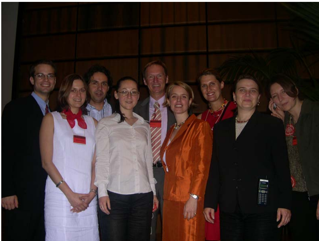
The organisation team for the 7 th World Conference on Injury Prevention & Safety Promotion You have done a great job. “We Thank You All” .