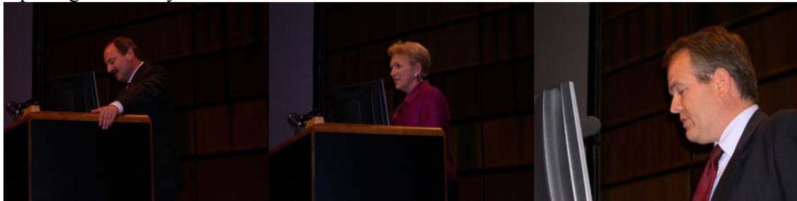
Mr. Hubert Gorbach: Austrian Vice-Chancellor and Ministry of Transport