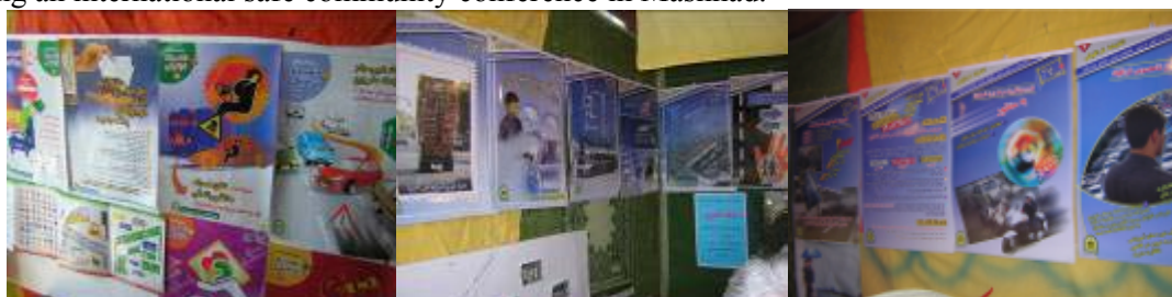
Police exhibition in Kashmar with informative posters

The delegation enjoyed a nice performance by group of children who sang a song translated to English. The context of song was about traffic safety and motorcyclists. They have indicated their interest for repeating this kind of integration between music and safety programme when they plan for hosting an international safe community conference in Mashhad.