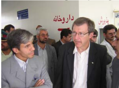
Hospital and emergency room, Surveillance system

We also visited the hospital and saw the new modified injury surveillance system. The new system has an active follow up of injured patients.