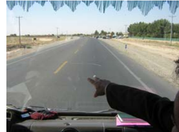
Lack of traffic lines in Kashmar is no longer a problem.

We had a discussion meeting with the committee and the new injury surveillance system and the active follow up was explained.