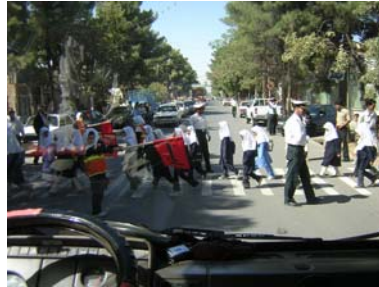
School police as part of the S.C activities in Kashmar.