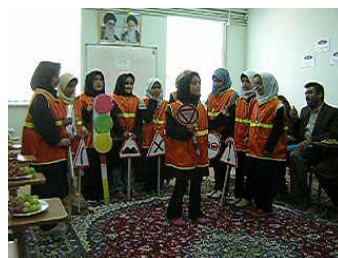
Children song about traffic safety & signs in Khalilabad