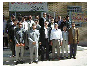
A group photo in Khalilabad health center