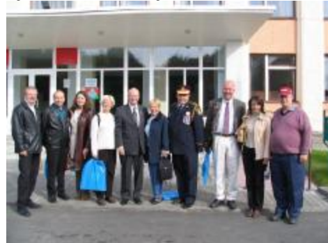
Sept 2004 Canadian Aid for Chernobyl delegation from Brockville

A World Health Organization collaboration centre on community safety promotion designation as a Safe Community was confirmed on Brockville as the first such designation in Ontario, second in Canada, fourth in North America, and 58 th globally.