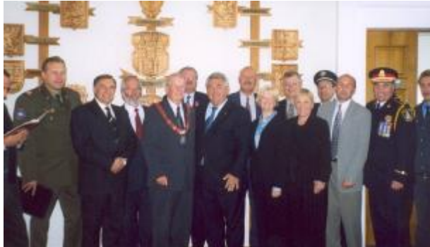
Canadian delegation visits Provincial Capital City Hall in Mogilev, Belarus