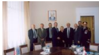
Delegation in Minsk (Capital city) on official visit with Governor.

A signing of a "Friendship" agreement between the Mayors of Brockville and Chaussy took place, further confirming the support of this Eastern Ontario city for Chaussy and its residents, who are the victims of the Chernobyl disaster which occurred 15 years ago. During the past four years, Brockville-based "Canadian Aid for Chernobyl" has provided more than $7 million ($24 Million as of 2004) Canadian in medical aid, clothing and supplies to Chaussy and also hosts 40 Belarus children annually for an 8-week respite where they are provided free medical and dental aid.