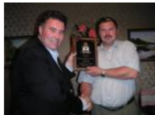
Chief Barry King presents Mayor of Chaussy, Belarus with a Brockville Police Plaque to commemorate the Sept 2004 visit to Chaussy and the special Safe Community mentoring relationship between the two cities.