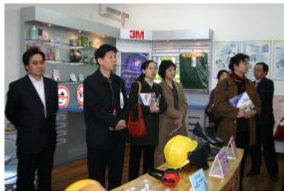
Commissaries visiting Wangjing Safety & Health Promotion Center

In the conference, it is mainly discussed to build Safety Community in 35 Olympics Fields and nearby, which stand at 7 districts in Beijing, 15 streets and 3 towns, including Dongzhimen Street in Dongcheng District; Sanlitun, Maizidian, Yayuncun, Aoyuncun and Nanmufang in Dongcheng District; Wanshoulu, Malianwa, Yanyuan, Xueyuanlu, Zizhuyuan, Beixiaguan and Huayuanlu in Haidian District; lugouqiao in Fengtai District; Laoshan and Pingguoyuan in Shijingshan District; Beixiaoying Town in Shunyi District; Chengbei, Nanshao and Shisanling towns in Changping District. In these places, Maizidian and Yayuncun street in Chaoyang District have begun to construct so far from October 2004.