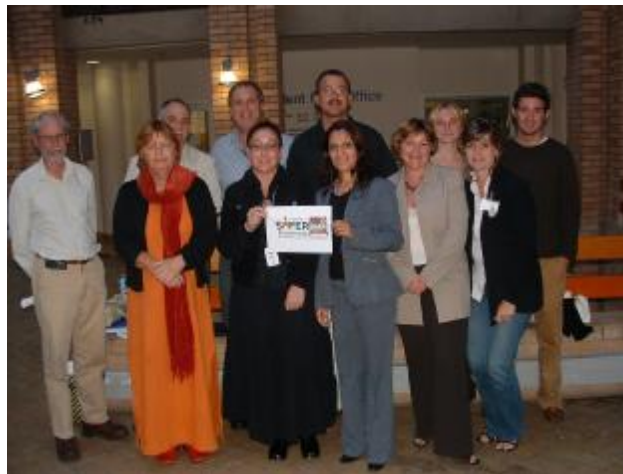
The Organizing Committee of the 15th International Safe Communities Conference in Cape Town.

Communities have been successful in preventing communicable diseases with vaccinations. It is now time for Communities to prevent trauma, injuries and violence.