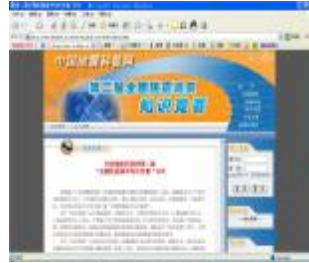
earthquake competition webpage

China is a country where earthquakes frequently occur. In order to publicize knowledge on earthquake, and to improve the public awareness of earthquake disaster prevention, an internet competition was held in China recently. The competition was organized by China Earthquake Administration, Ministry of Science and Technology, and co-organized by China Earthquake Network Center (CENC). Participants of the competition are mainly pupils from middle and primary schools and young people in China. In Youth Park Community, young residents are taking actively part in the competition by surfing the internet.