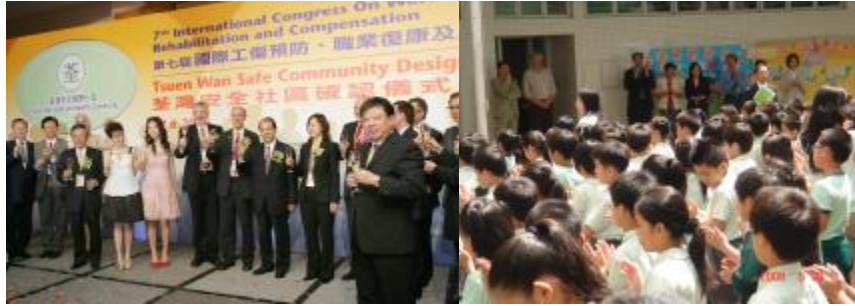
Toasting the newest member of the Safe Community family....