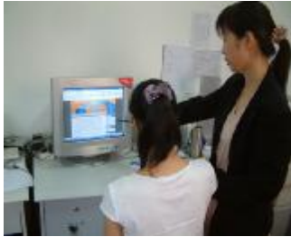
Young people taking part in online competition