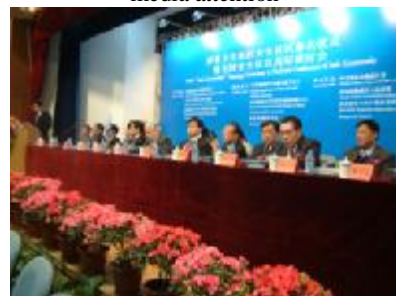
Government leaders attending the ceremony