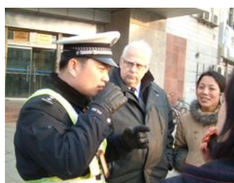
Drunk driving talk with local traffic police

For more information on Youth Park Safe Community program: www.phs.ki.se/csp/safecom/youth_park_china.htm