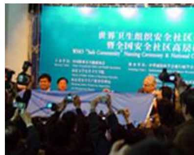
The ceremony attracted great media attention